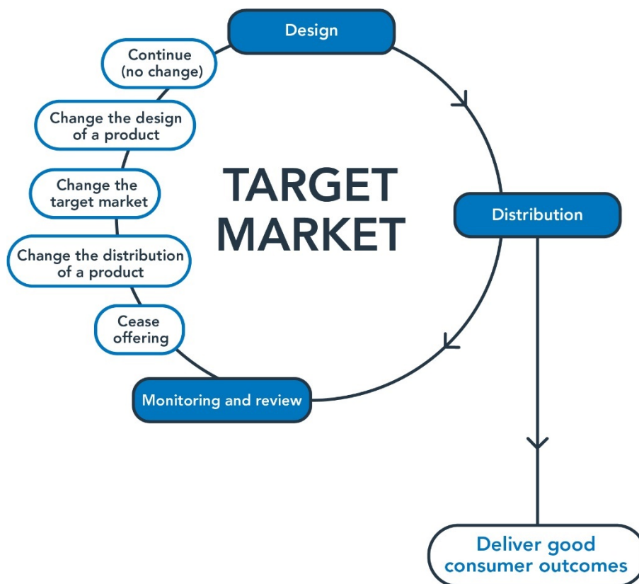
Figure 2: Consumer-centric approach to design and distribution

Note: See RG 274.35–RG 274.38 for the information in this figure (accessible version).