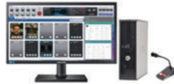
Desktop Console, Mobile