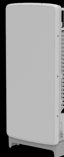
64T/64R Massive MIMO Radio (Tower)