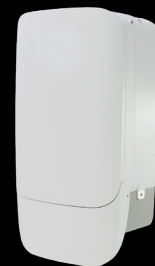
4T/4R 20W Radio (Pole/Wall/Tower Mount)