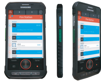
Smartphone for Public Safety

From infrastructure to device, Samsung is ready to provide a full end to end solution for PS-LTE. The device is a user-friendly smartphone type and is based on world-renown Samsung smartphone technology. The smartphone is designed additionally to carry out the optimal PTT function by adding a Push-to-All (PTA) button on the side. Durability is a paramount focus of the device, including both waterproof and dustproof ratings.