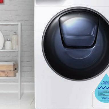
QuickDrive™ | WW95T984DSH/SP