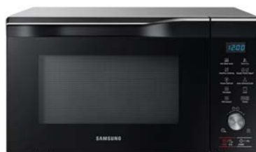
MC32K7055KT/SP 32L, Convection Microwave Oven