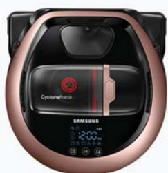
POWERbot™ VR20R7250WD/SP 20W Turbo Suction Power Robot Vacuum Cleaner