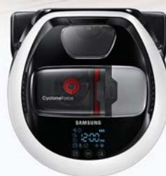
POWERbot™ VR10M7020UW/SP 10W Turbo Suction Power Robot Vacuum Cleaner