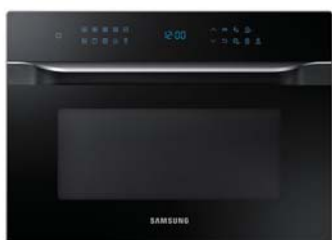
MC35J8088LT/SP 35L, Convection Microwave Oven