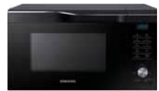
MC28M6055CK 28L, Combi, Convection Microwave Oven