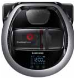
VR20M7070WS 20W Turbo Power Suction Robot Vacuum Cleaner