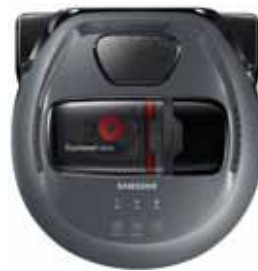
VR10M7010UG 10W Turbo Power Suction Robot Vacuum Cleaner