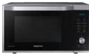
MC32J7055HT 32L, Combi, Convection Microwave Oven