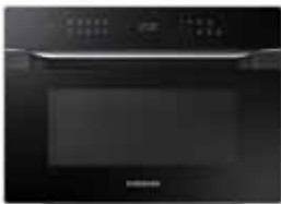
MC35J8088LT 35L, Combi, Convection Microwave Oven