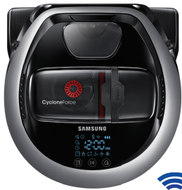
VR20M7070WS 20W Turbo Power Suction Robot Vacuum Cleaner