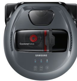
VR10M7010UG 10W Turbo Power Suction Robot Vacuum Cleaner