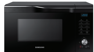
MC28M6055CK 28L, Combi, Convection Microwave Oven