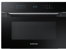
MC35J8088LT 35L, Combi, Convection Microwave Oven