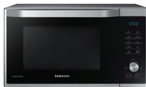
MC32J7055HT 32L, Combi, Convection Microwave Oven