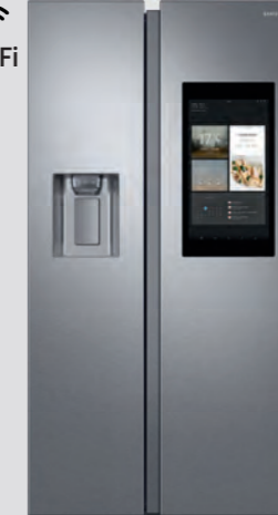
593L American Style Family Hub™ Fridge Freezer - RS68N8941SL

Built-in cameras will let you see what's inside, so you can check what you have left from your phone whenever you're out*. So even when you're shopping, you can take a quick look.