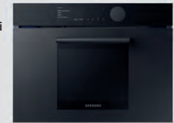
Graphite Grey - Full Touch Model