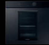
NV75T9579CD Non Steam