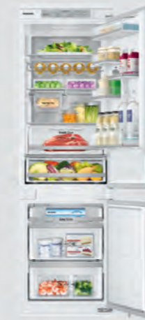
263L Integrated Fridge Freezer BRB260087WW (Slide Hinge)

Party ice cream or the Christmas turkey. When you need extra space, use the Smart Convertible Zone to switch between a fridge or a freezer, and control it with four temperatures.