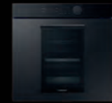
NV75T9879CD Steam Assist Only