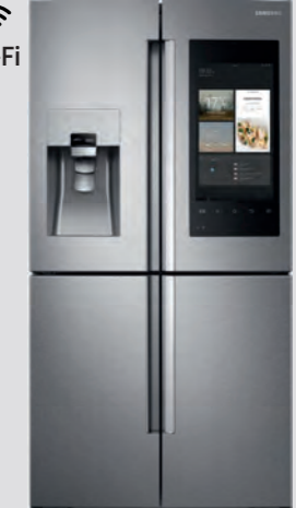
550L Family Hub™ French Door Fridge Freezer - RF56M9540SR

From sharing shopping lists to coordinating schedules, this fridge keeps your family connected*. Bring your kitchen to life with home entertaining. Play your favourite tunes or catch up on the latest TV series while you cook.