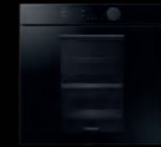
NV75T8979RK Real Steam & Steam Assist