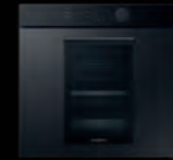
NV75T9979CD Real Steam & Steam Assist