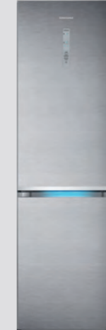
355L Freestanding Combi Fridge Freezer - RB36R883PSR

Party ice cream or the Christmas turkey. When you need extra space, use the Smart Convertible Zone to switch between a fridge or a freezer, and control it with four temperatures.