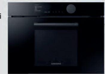
Onyx Black - Non Full Touch Model