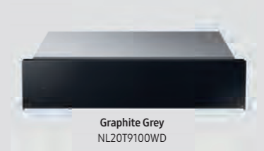
Graphite Grey NL20T9100WD

For easy access gently push the door for it to open out smoothly.