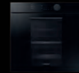
NV75T8579RK Non Steam